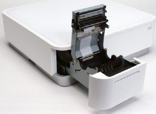
"Drop-In and Print" Paper Loading