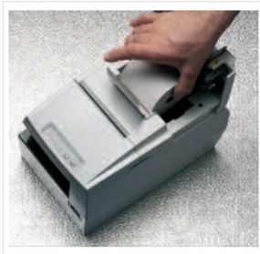
Easy Paper Loading