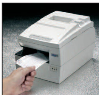
Check MICR Reader