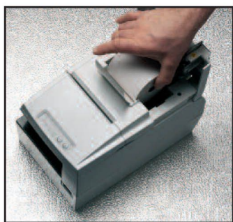
Easy Paper Loading

The HSP7000 combines key features from Star's celebrated range of products, including the speed and reliability of the market leading TSP700II Series, and the engine from the high speed SP700 dot matrix printer. Star is bringing over 30 years of "know-how" in POS to the HSP7000; resulting in customers receiving the features they need with the reliability they demand, minus the overhead of unnecessary features and associated cost.