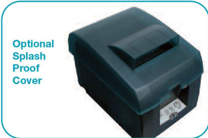
Optional Splash Proof Cover