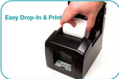
Easy Drop-In & Print