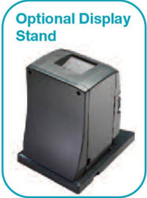
Optional Display Stand