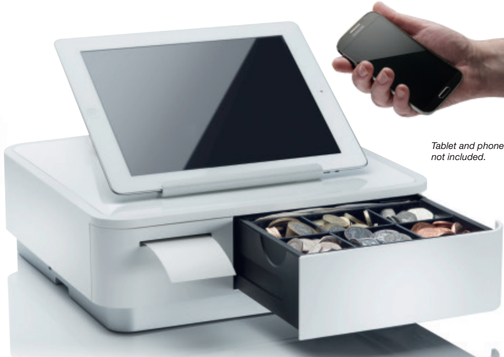
Tablet and phone not included.

Outstanding connectivity and design, plus intuitive functionality and simple integration are delivered ready to work with your chosen, mobile, software and card payment system. Welcome to a new era for mPOS.